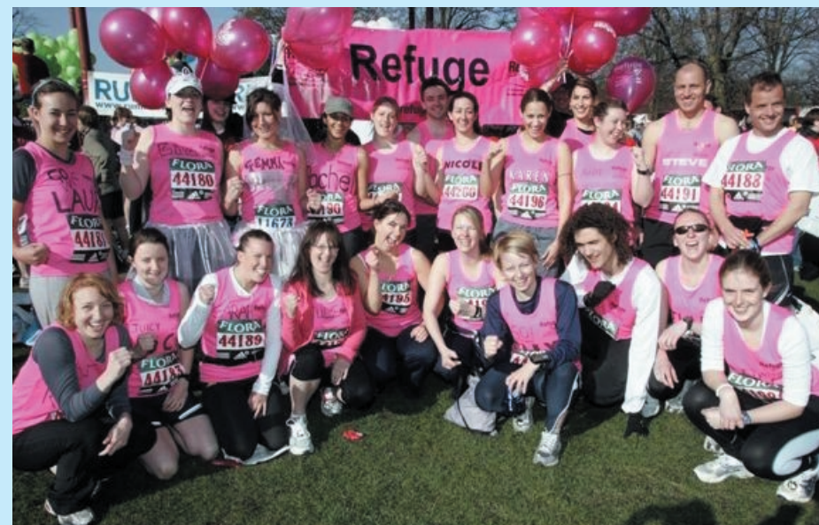
2005 Refuge Marathon team